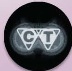
X-Ray Correct Identification

Unique Radiopaque Symbol for Power Identification and Flipped Port Detection.